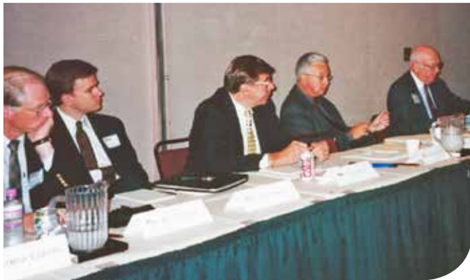
Members of advisory board