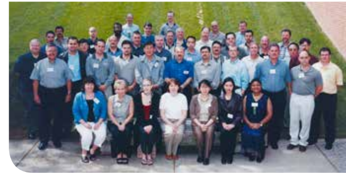
Industry Short course participants

( http://foodindustrycenter.umn.edu/Research/WaiteLibrary/index.htm )