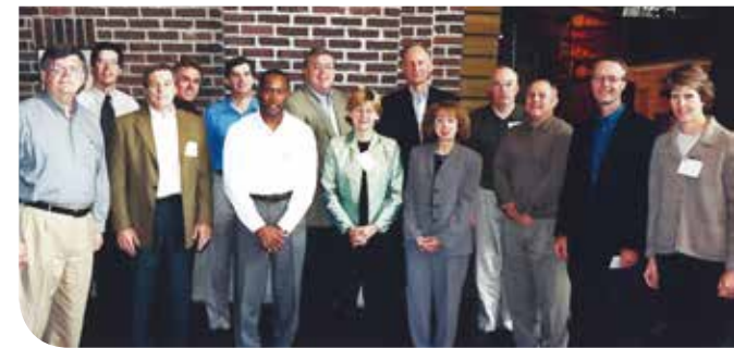
Program Leadership Board