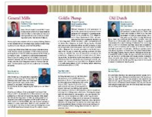
Minnesota Food Producers Luncheon